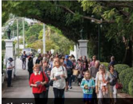
9 June 2018 Government House Open Day attracted 1,500 visitors, confirming Fernberg's place as A House for all Queenslanders.