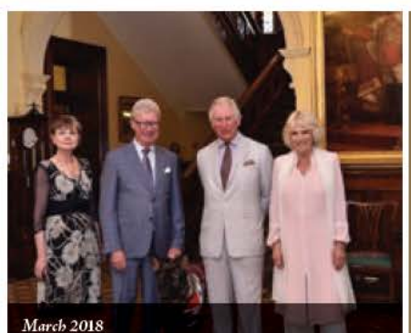
March 2018 Government House bosted a visit by His Royal Highness The Prince of Wales and The Duchess of Cornwall in the lead up to the Gold Coast Commonwealth Games.