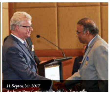
11 September 2017 An Investiture Ceremony was held in Townsville, honouring outstanding men and women from across North Queensland.