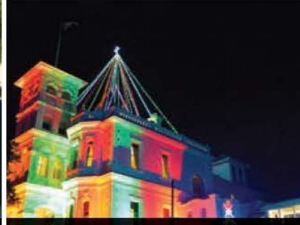
December 2017 More than 11,267 people came through Fernberg's gates for the annual Christmas Lights Display.